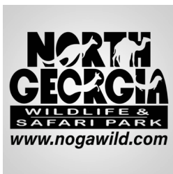
Jr. Zookeeper Day Camp July 6th & 7th