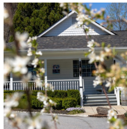
Weekend Music July 4th-5th Accent Cellars Every Saturday & Sunday