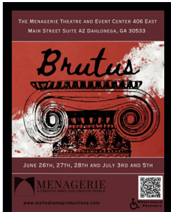
Brutus July 3rd - 7pm July 5th - 3pm The Menagerie Theatre and Event Center