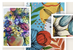
Bunches of Flowers - Paint, Paper & Pens Class July 9th 2:00pm-4:30pm Old Storehouse Art