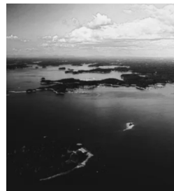
Haunted Lake Lanier Tour & Paranormal Investigation July 5th 7:25pm-9:30pm North Georgia Excursion