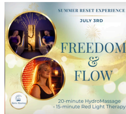
Freedom & Flow: a Summer Reset Experience July 3rd Helio Healing