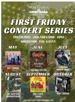
First Friday Concert July 3rd 6:30pm-8:30pm Hancock Park