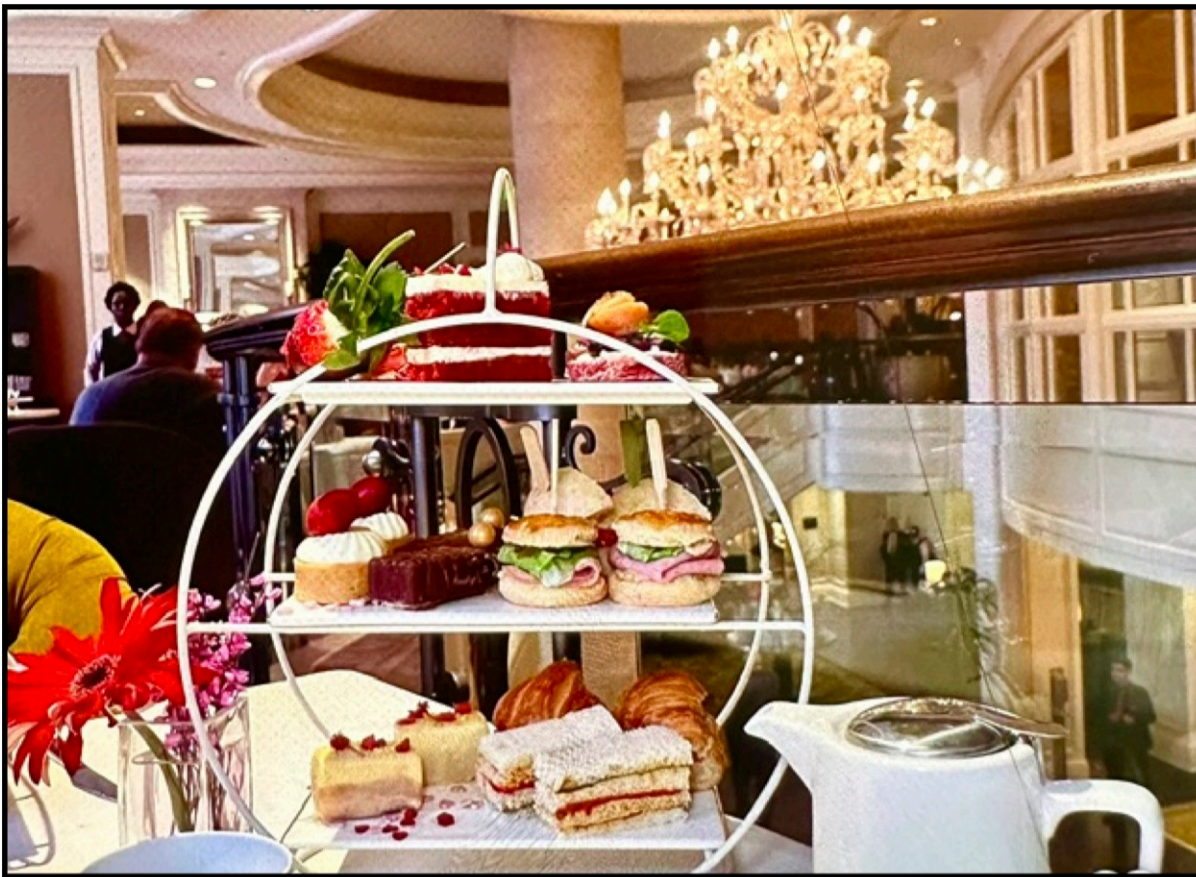
Small delicious bites!