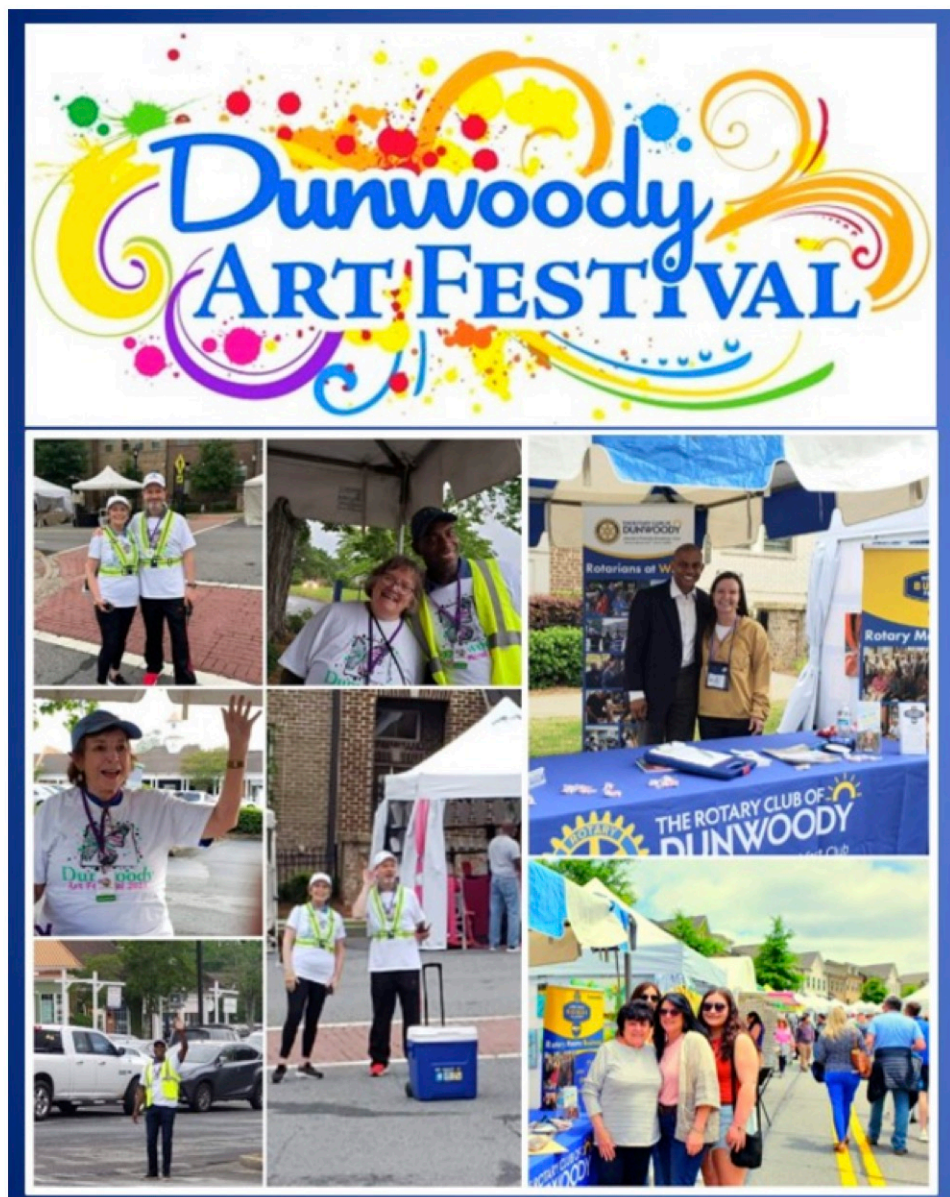
Display of Dunwood Art Festival!

One of the most prominent events in the Atlanta area is the Dunwoody Art Festival held on May 9 & 10th . It is a free festival held every year on Mother's Day weekend. The Dunwoody Art Festival is a lively and colorful way to celebrate Mother's Day in Georgia, transforming Dunwoody Village Parkway into a vibrant outdoor art market filled with creativity and community spirit. Families can stroll through rows of booths featuring handmade works like paintings, jewelry, ceramics, and glass art while enjoying live music and street performers throughout the day. The festival also includes interactive activities, making it fun for all ages, along with food vendors offering classic