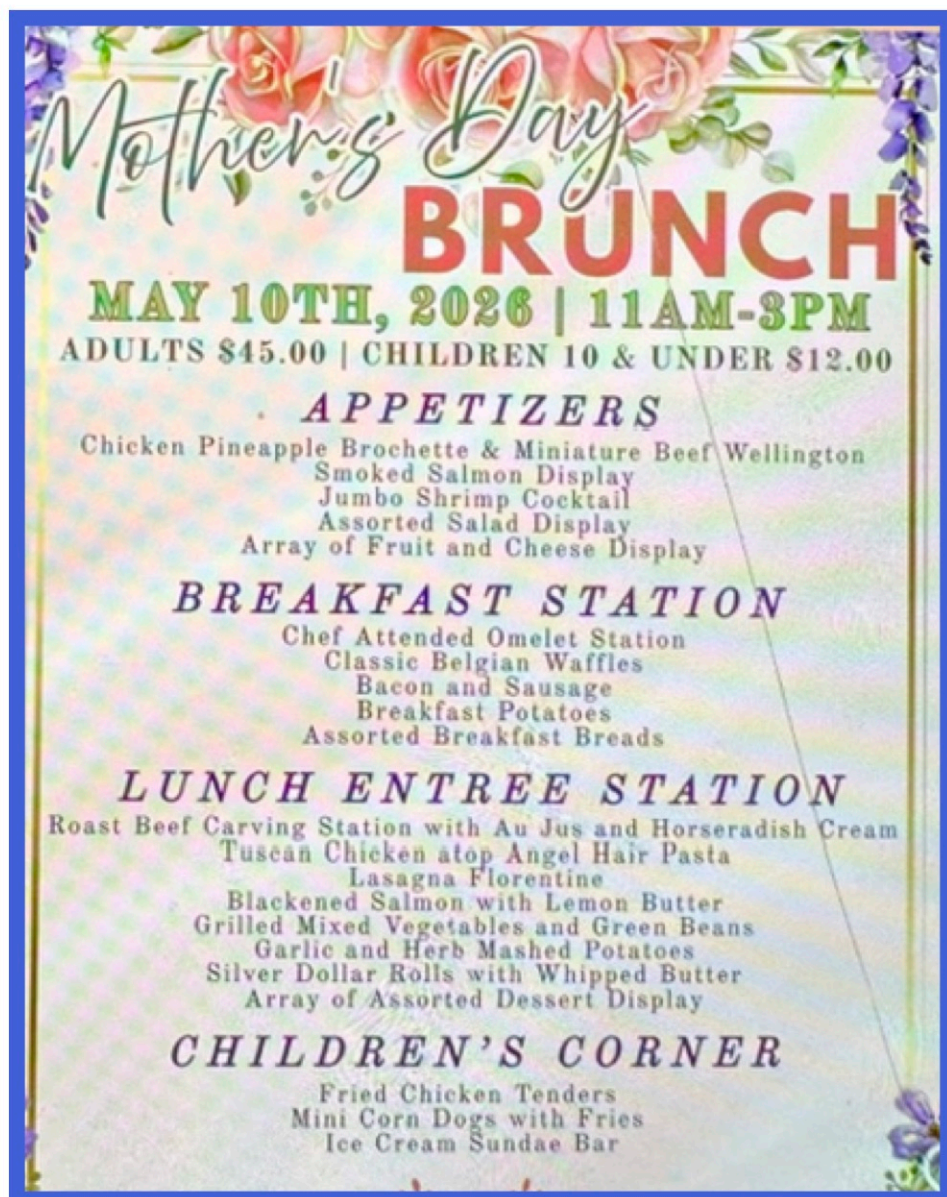
Sample of a brunch menu!