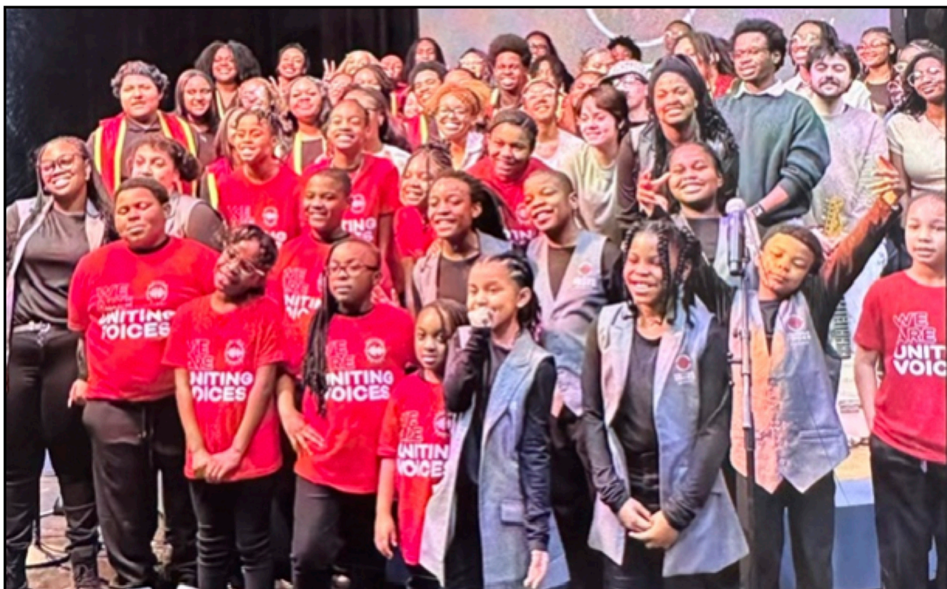
Gospel choir performing for Mother's Day!