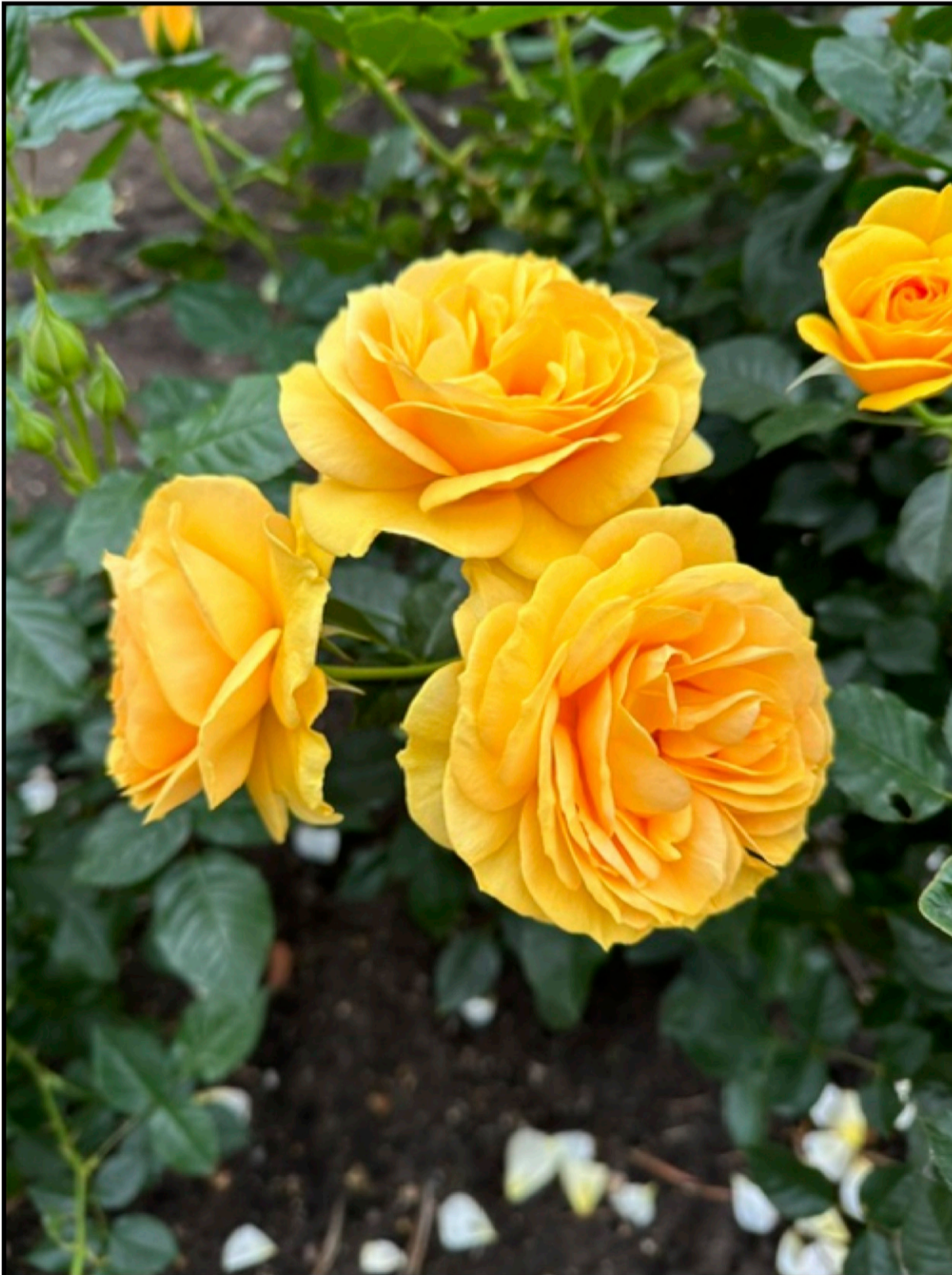
Beautiful yellow rose before display!

Roses. The show will turn something familiar, the rose, into something almost enchanting. Rather than just displaying flowers, the show frames roses as living works of art, highlighting their extraordinary variety in color, shape, and fragrance. Mothers will certainly enjoy this display, where each bloom feels theatrical, showing how roses can transform from simple garden plants into symbols of beauty, elegance, and even illusion. This is a delightful event to attend with our mom.