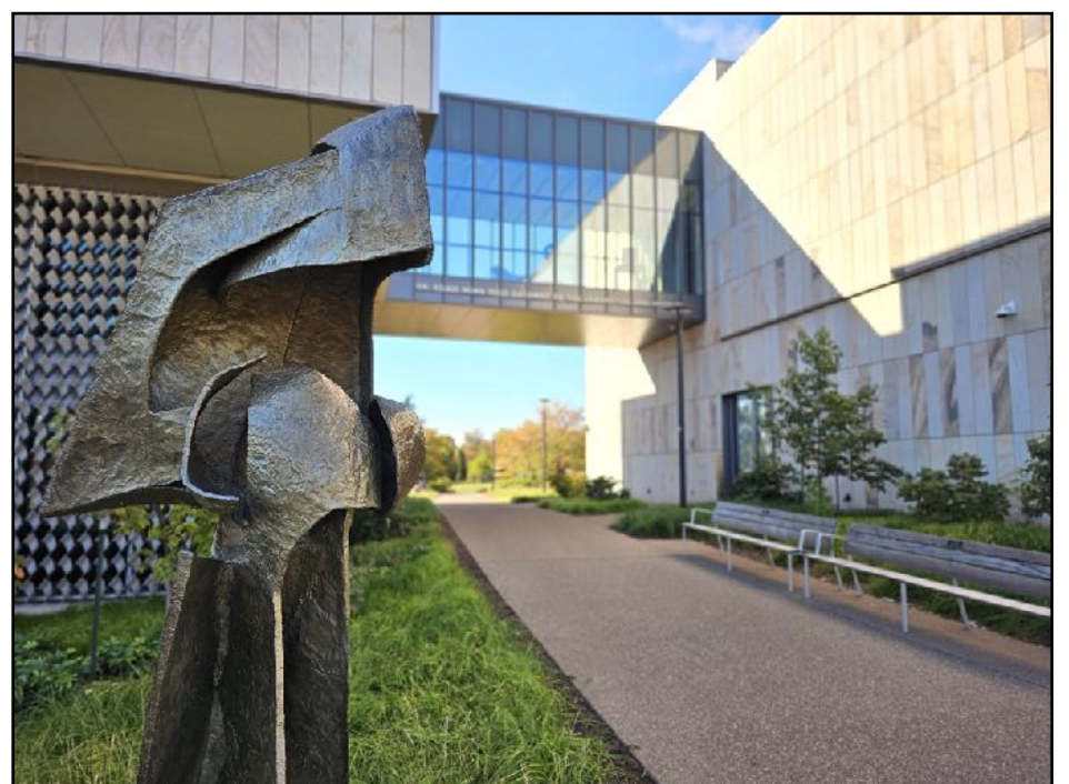
Palmer Museum of Art!