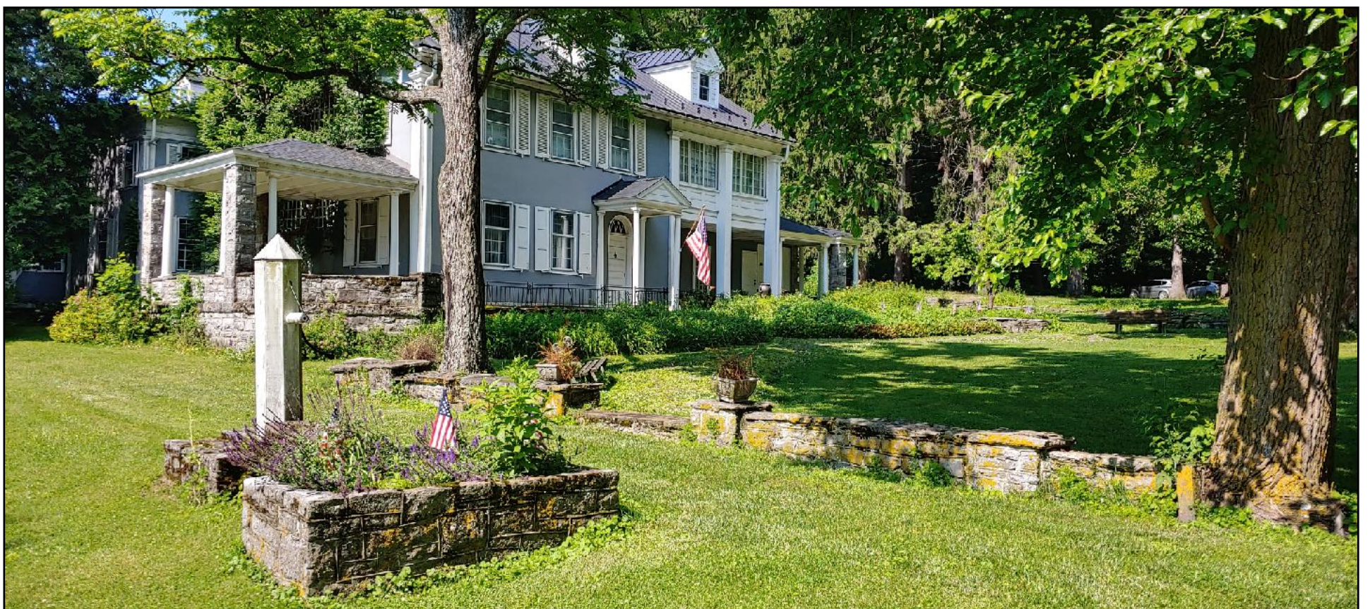
Boal Museum!

Nearby, outdoor art turns the entire downtown heart of State College into an outdoor museum. A downtown Art Walk trail features 40 murals, sculptures, statues, stained glass and other works.