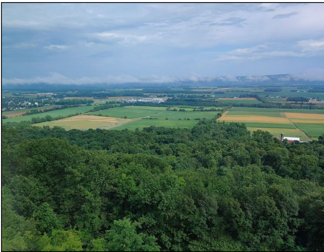
Happy Valley Overview!

Penn State offers an atmosphere characterized by youth, vibrancy and culture. Founded in 1855, it has 20 campuses throughout Pennsylvania, its main site being adjacent to the center of downtown State College.