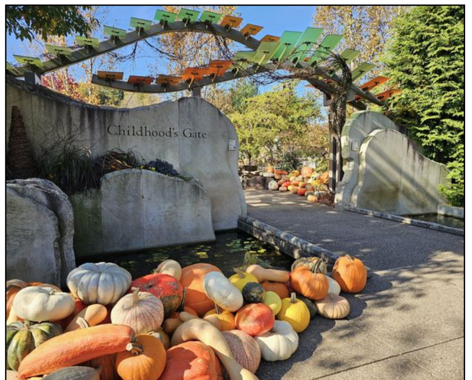
Aboretum at Penn State!