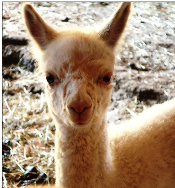
Adorable alpacas at a ranch in Happy Valley, PA!