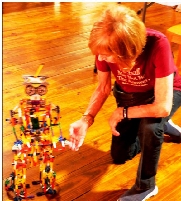
Sharing floor space with robots at the Maker's Faire in Happy Valley, PA!