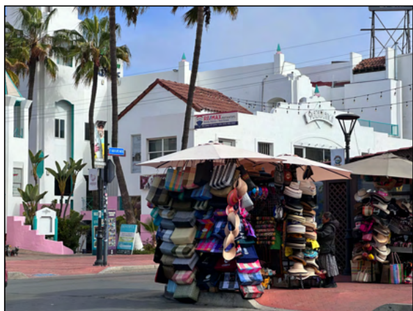
Vendors in downtown area!