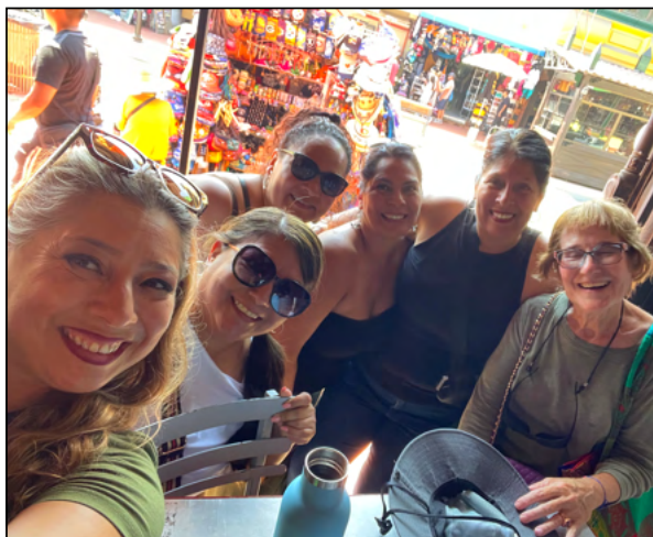
New friends we met in downtown!