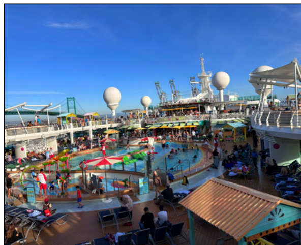
More fun on the ship!