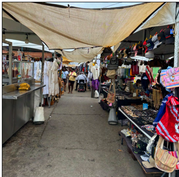
Beautiful display of merchandise in Ensenada!