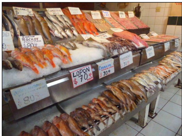
Mercado Negro Market!