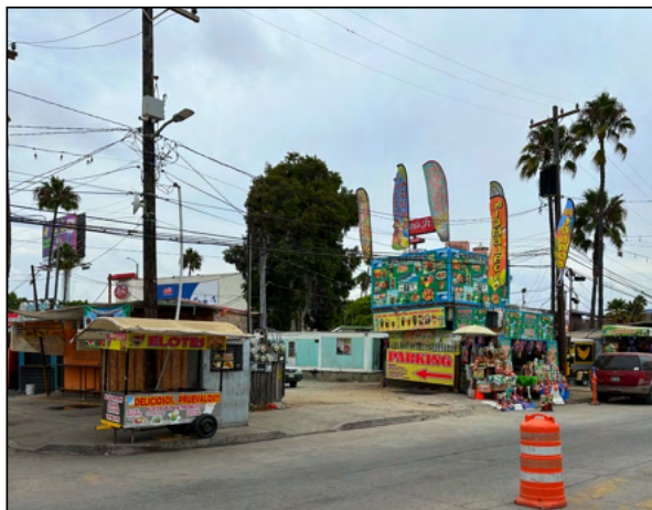
Downtown area of Ensenada!