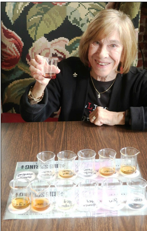
Savoring flights of hand-crafted cocktails at Big Spring Spirits in Happy Valley, PA!