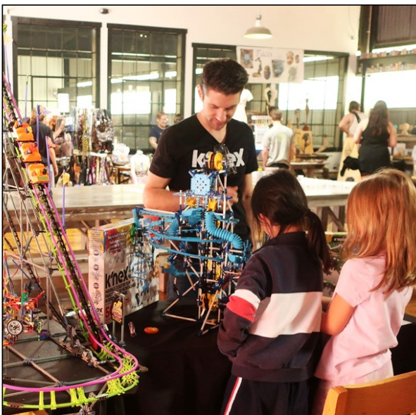
So much to see and do at Happy Valley's Maker's Faire!