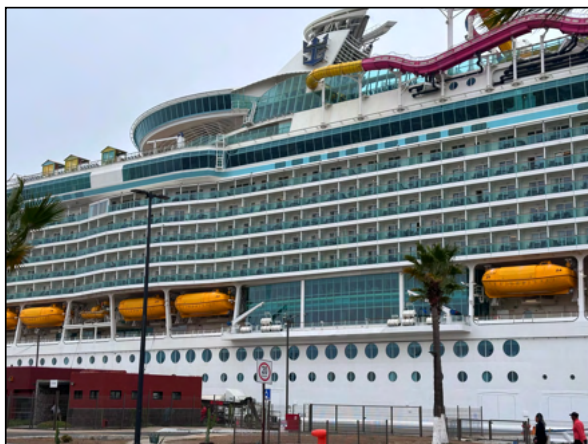
View of the ship!