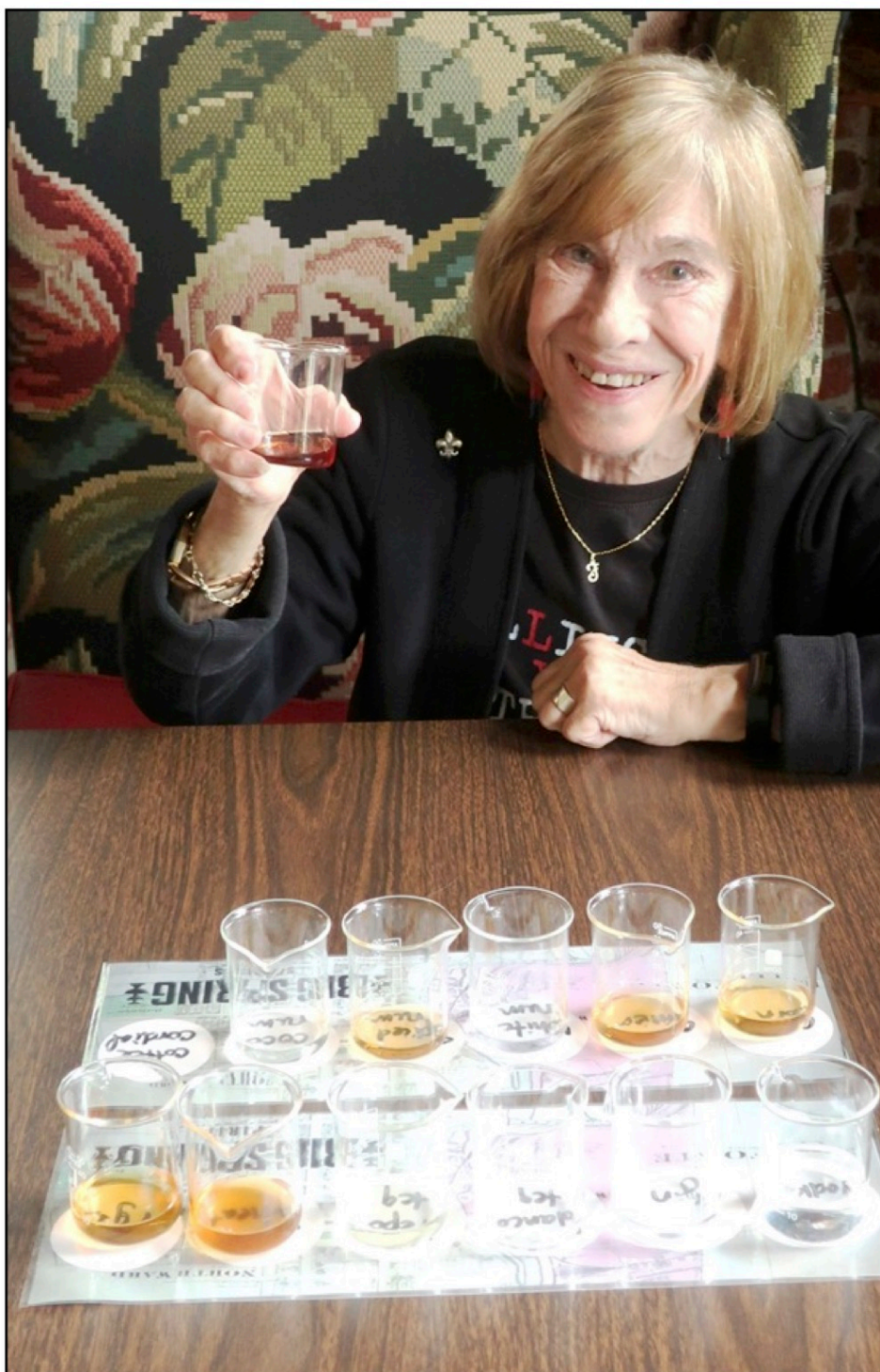
Savoring flights of hand-crafted cocktails at Big Spring Spirits in Happy Valley, PA!