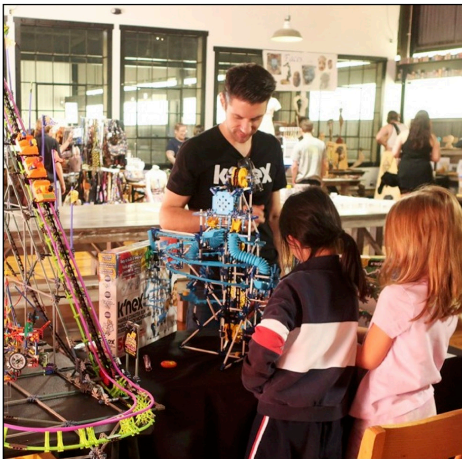
So much to see and do at Happy Valley's Maker's Faire!