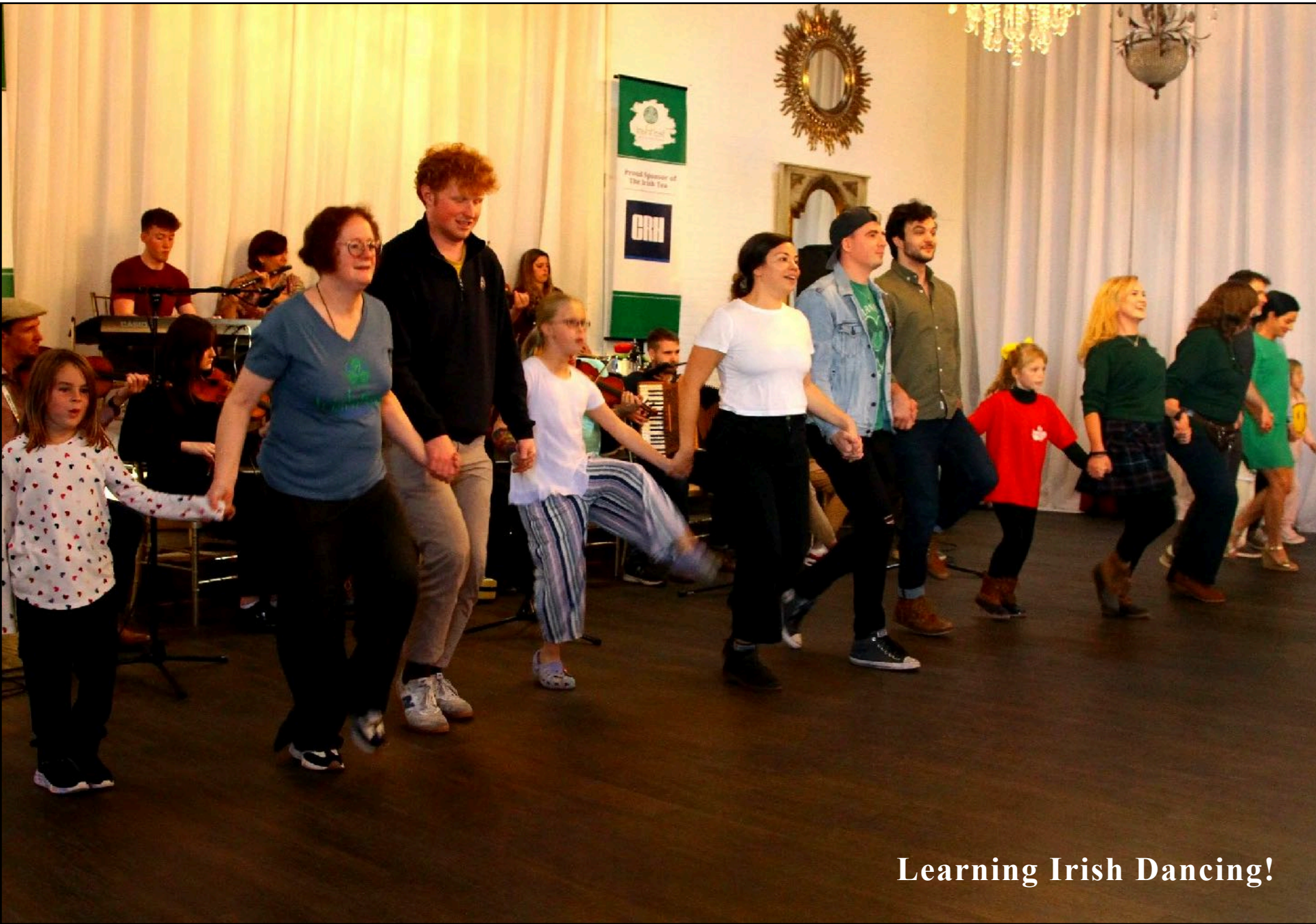
Learning Irish Dancing!