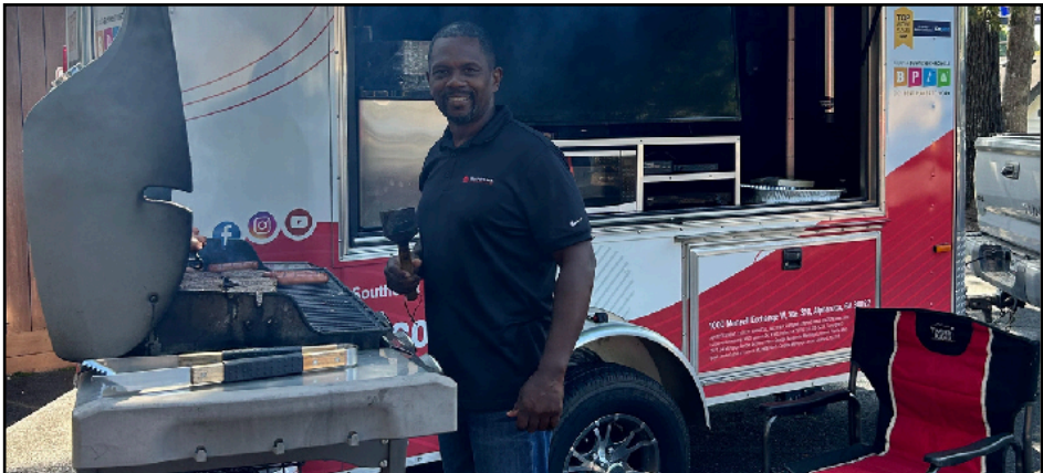
Our heroes were treated to a full cookout experience thanks to Supreme Lending!