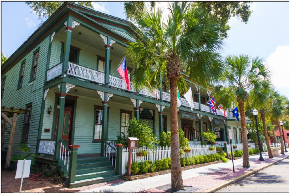
2018 Amelia AR Miles Stills 034A