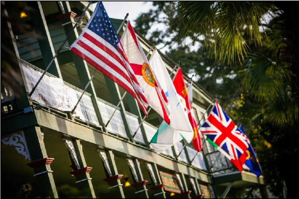
Eight Flags of Amelia Island – Florida House Porch!