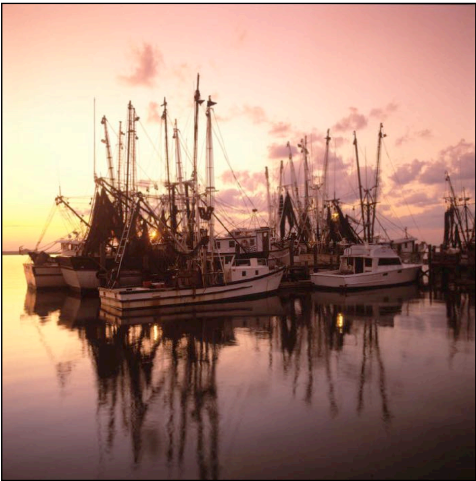
Shrimp boats at rest – Photo by Victor Block!