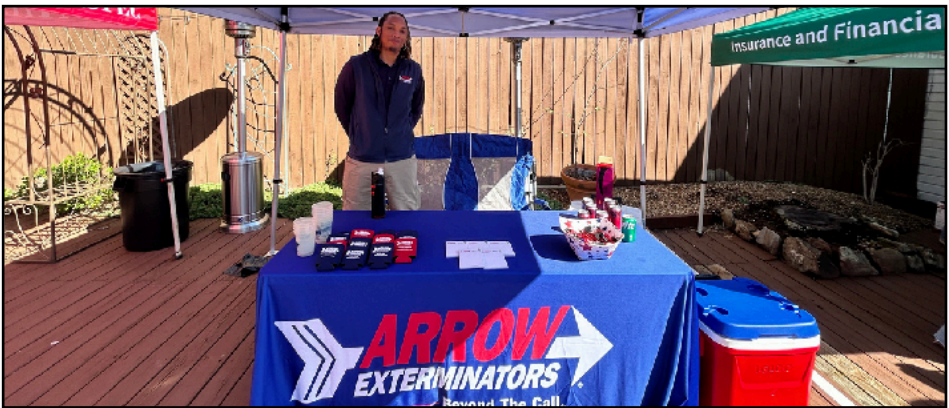
Arrow Exterminators proudly supplied beverages for the event, ensuring everyone stayed refreshed throughout the afternoon!