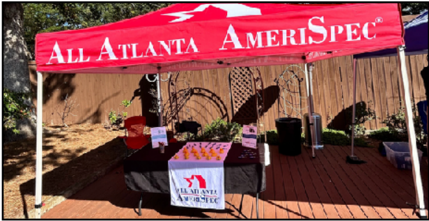
The AmeriSpec Team contributed to the event with giveaways and interactive activities, enhancing the fun and community spirit on the patio!