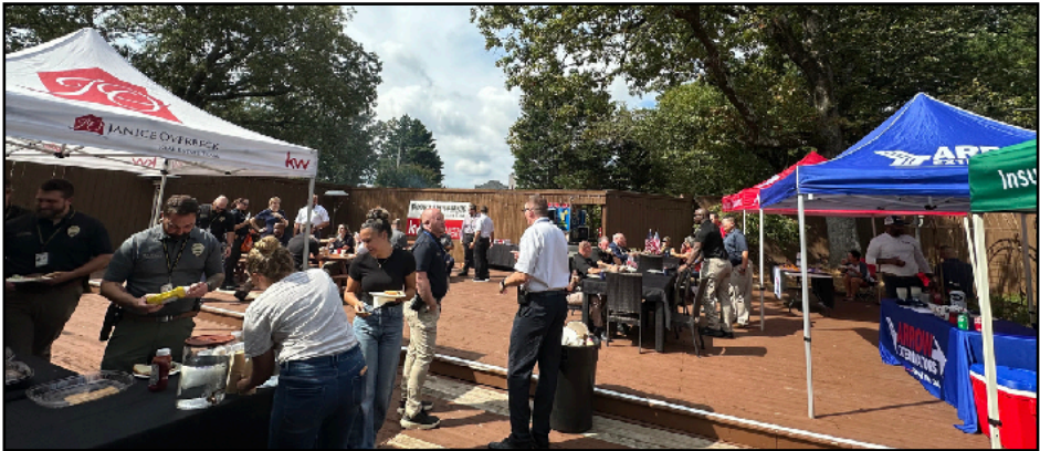
Our patio was filled with hometown heroes, from police officers to firefighters to military personnel... all enjoying food and fellowship under the warm Georgia sunshine!