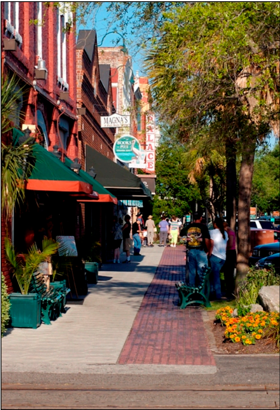
Cobblestone streets and shops in town!