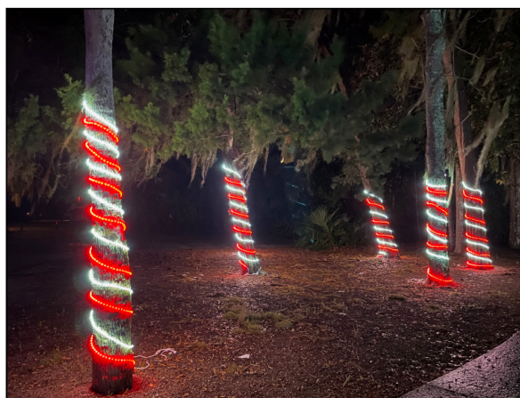
Downtown Jekyll Island!