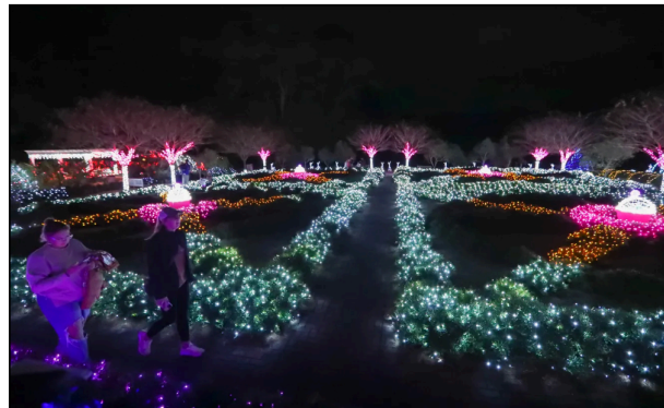
Savannah Magical Gardens!