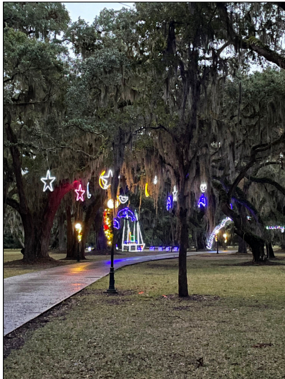
Historic District Jekyll Island!

Fantasy in Lights at Callaway Gardens is one of those classic Georgia Christmas experiences that feels like it is straight out of a holiday movie.