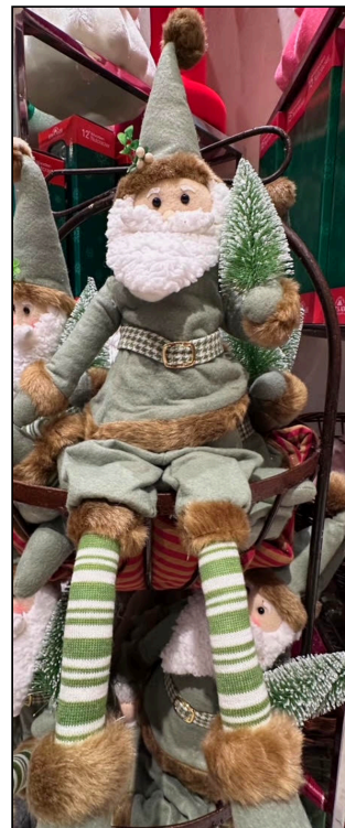
Cute decorations for Christmas trees!

So save some dates in December and some of the fantastic events occurring all through December in Georgia. Check out the websites for more information.