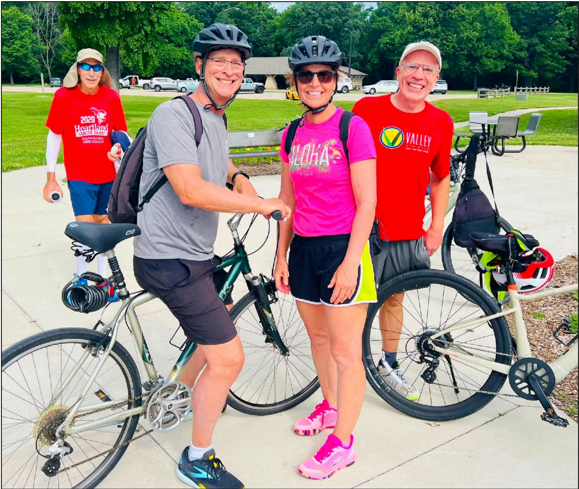
Getting ready to go to the court!

So, there we have some inspiration to start a new game. If you have never played before, call your local YMCA, or Senior Center, and they will lead you to a new challenge that is entertaining, fun and social. So, let’s get ready for a great adventure, and soon we will say "I'm going to get pickled!"