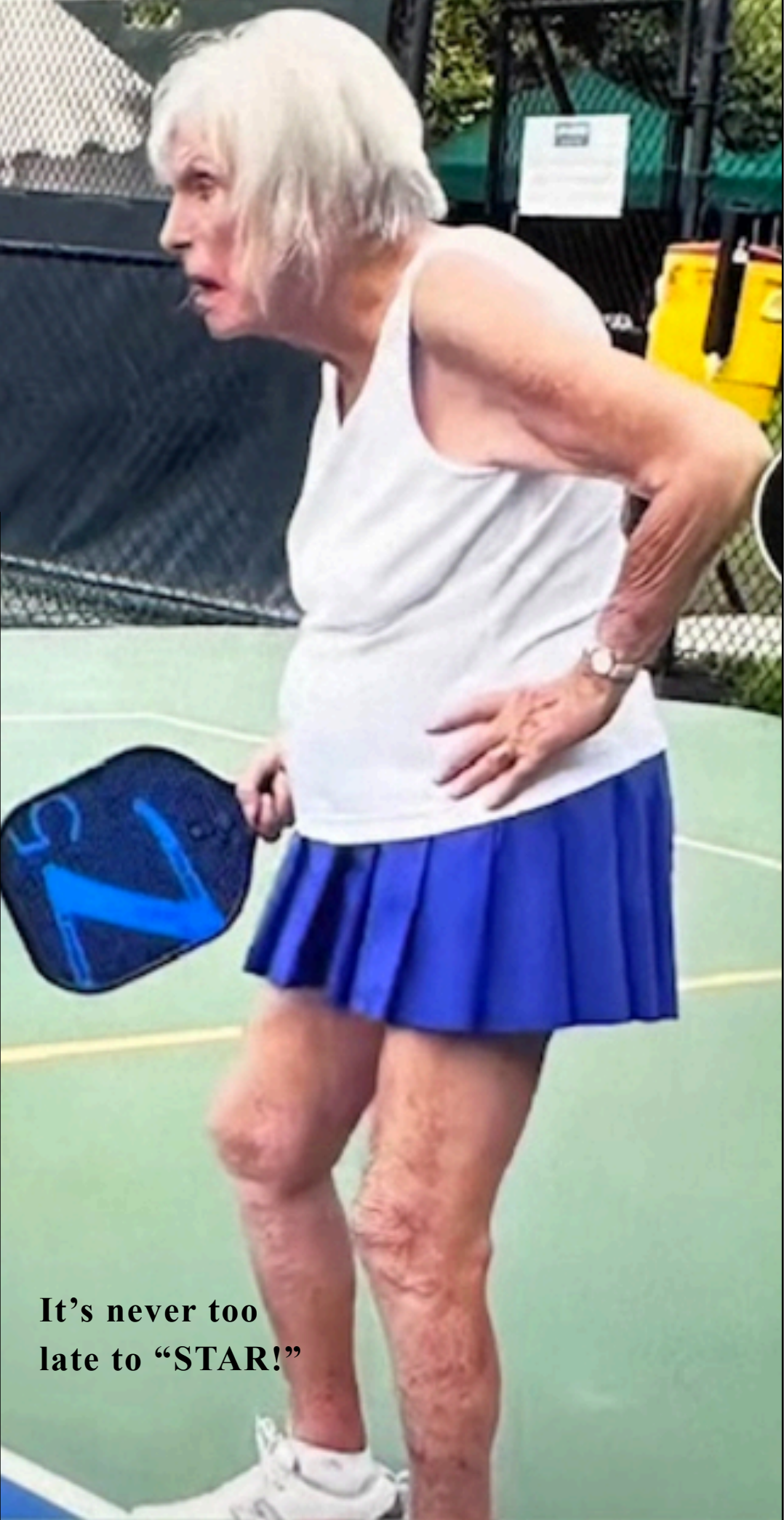
It's never too late to "STAR!"