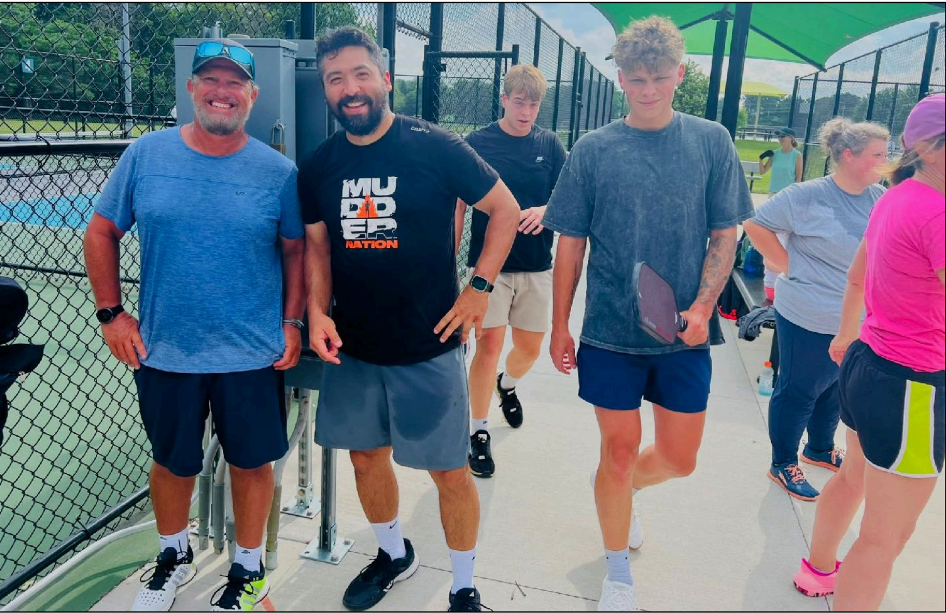
They got pickled!