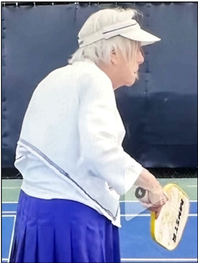
Yes... she is ROCKIN'!