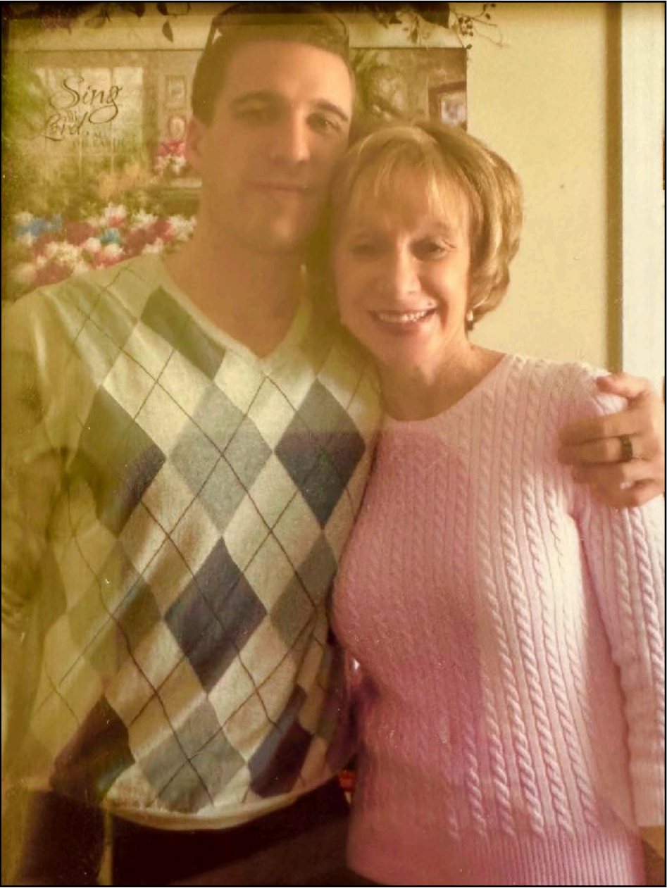
Sharing and bonding between mom and son!