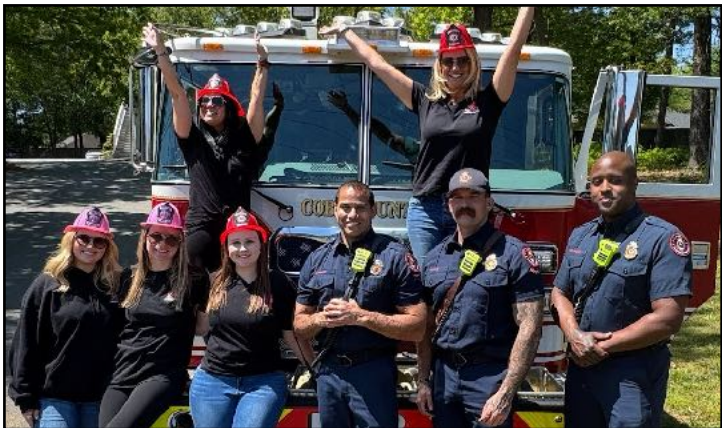
Firefighters attending the appreciation lunch at the Janice Overbeck Real Estate Team office.

Attendees lined up to grab hot-dogs and hamburgers. The event not only offered a hot lunch but also a strong sense of community support and appreciation. Local businesses and citizens were excited to take part in recognizing some of the hardest working men and women in the region.