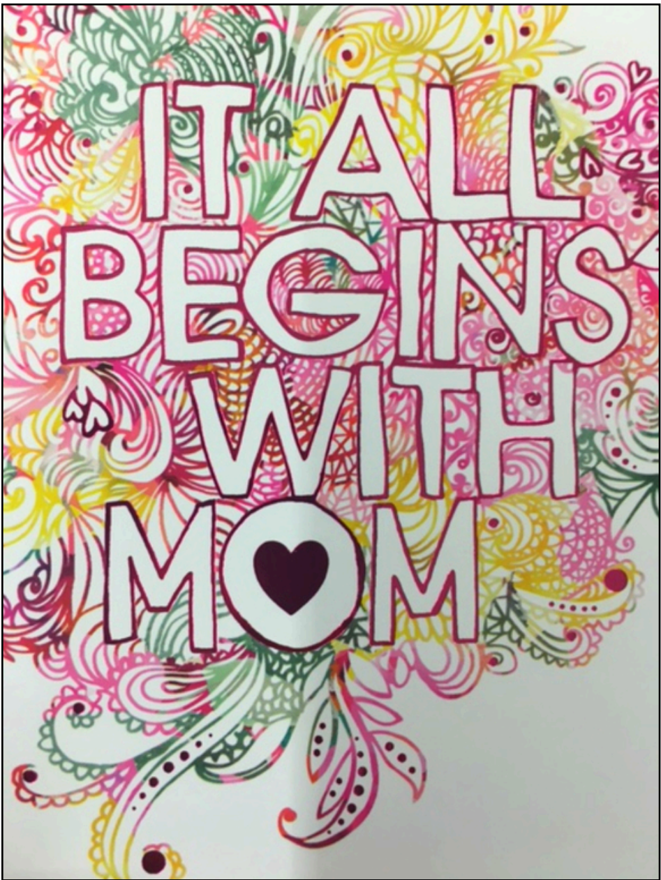
Life does begin with our moms!