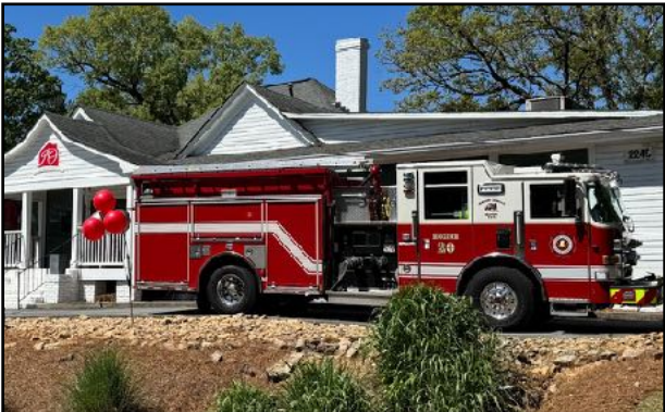
Station 20 parked out in front of the Janice Overbeck Real Estate Team office.