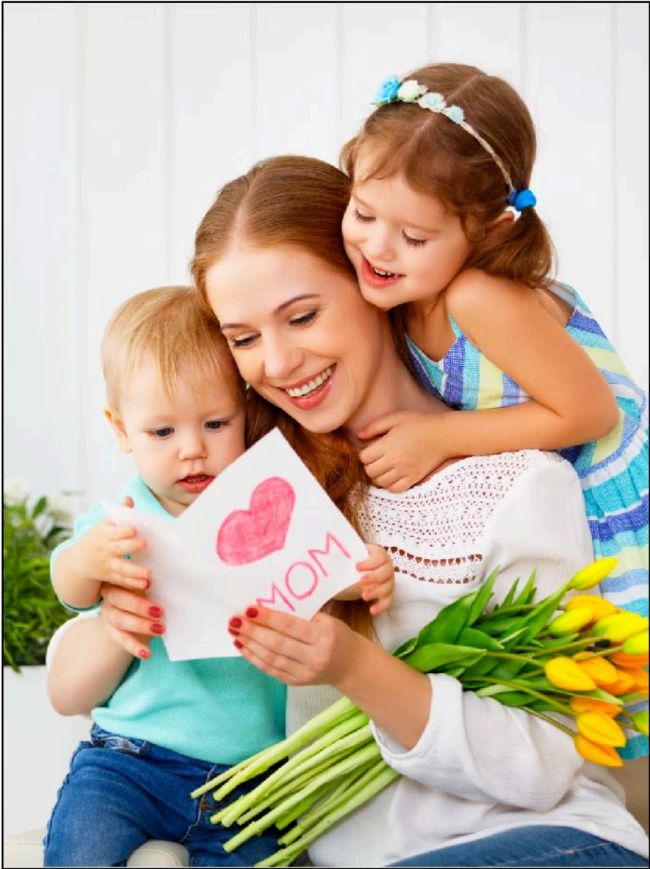
Yes, a handcrafted card for a mom!