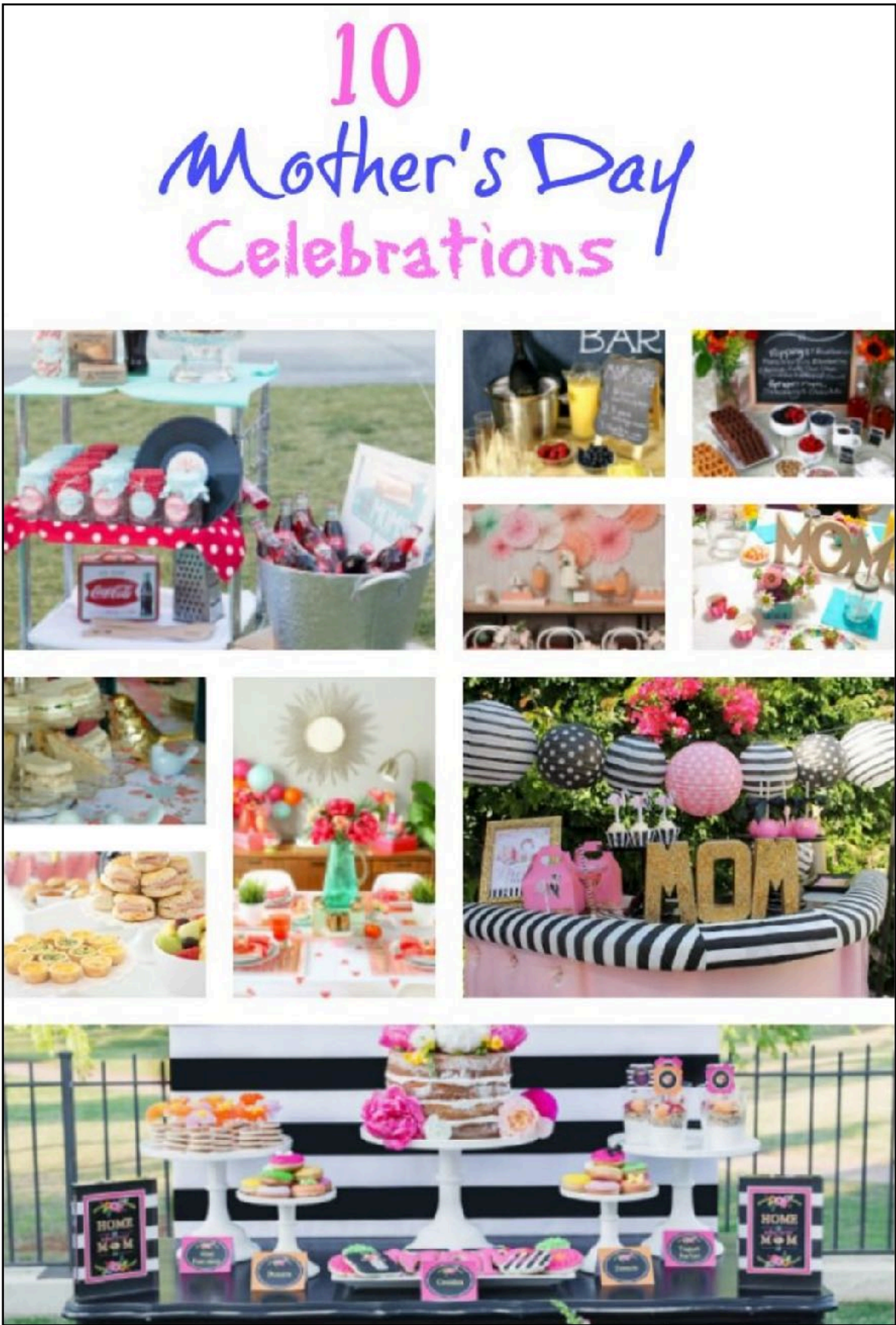
A collage of events!

So, whatever we choose to do on Mother’s Day, let’s all keep in mind the history of this day of honoring our moms and remember to take time to appreciate our moms, step-moms, auntie moms and grandmother moms.