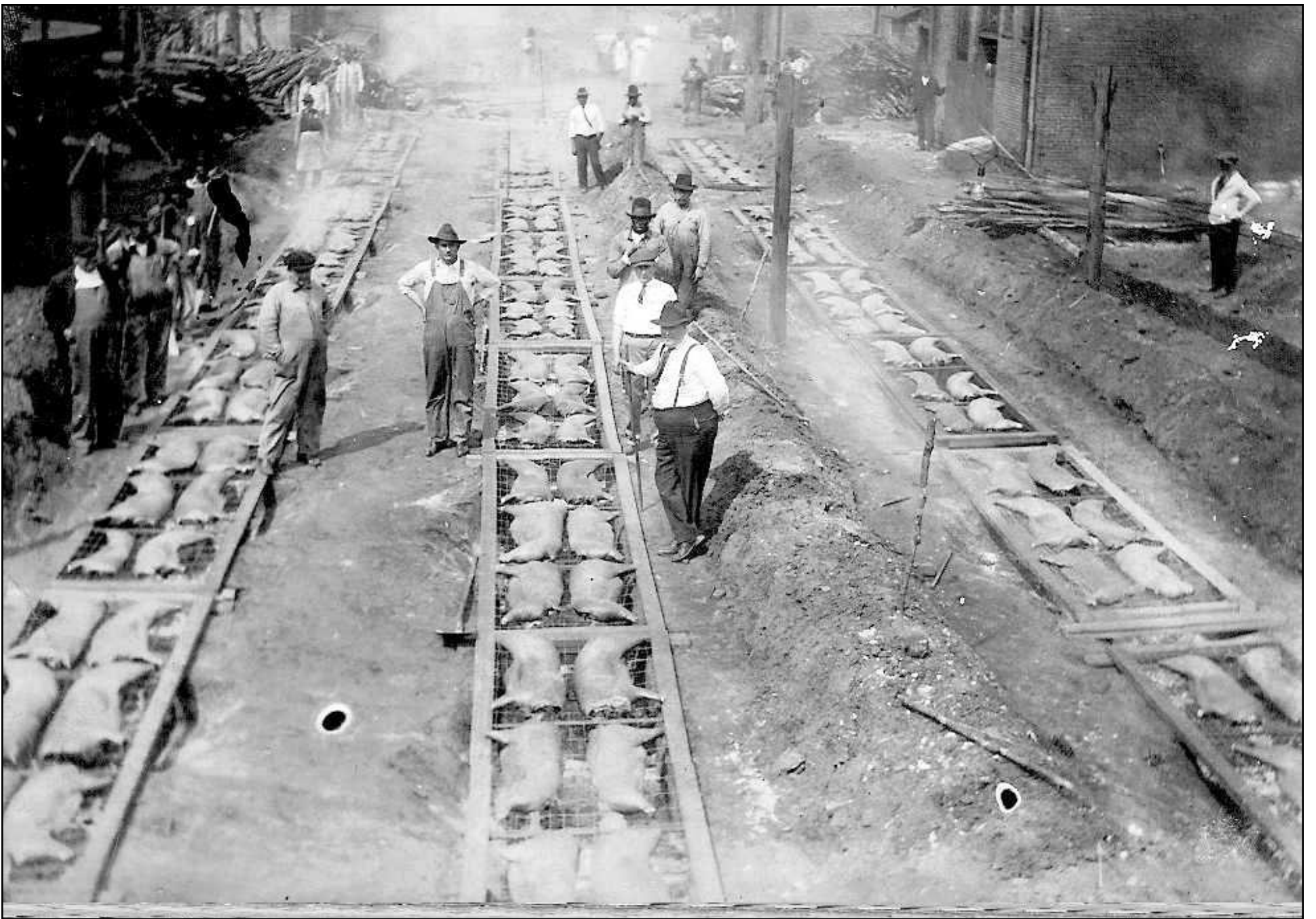
Preparing delicious “pit cooked BBQ” for celebrating the “Peach Blossom Festival” in the early days!

Musical acts included the A2Z band and Edwin McCain. The headliner was the infamous 1970’s rock band “.38 Special,” who performed from 7:30-9:30 pm.